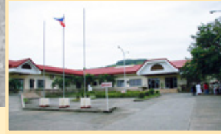
St. Camillus Hospital of Mati DAVAO ORIENTAL