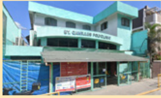
St. Camillus Polyclinic MAKATI CITY