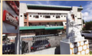
St. Camillus Medical Center PASIG CITY