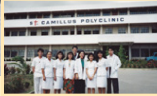
St. Camillus Polyclinic ANTIPOLO CITY