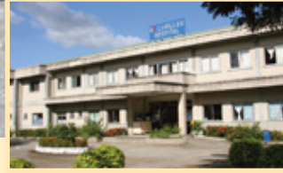
St. Camillus Hospital CALBAYOG CITY, SAMAR

The third St. Camillus Polyclinic was established in Brgy. Inarawan, Antipolo, and was inaugurated on January 4, 1992.