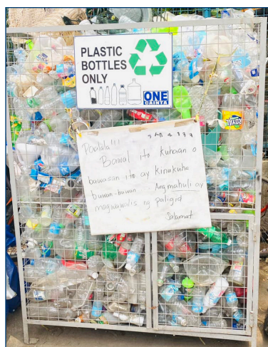
One way of caring for the environment is through recycling of plastic materials.

we are completely connected. This helps to explain why the Church promotes the greatest respect for human life, from conception to natural death. Destruction of human life at any stage violates the absolutely fundamental human dignity upon which all human rights and responsibilities rest.