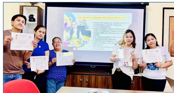
SCCHH staff receive their certificates of completion