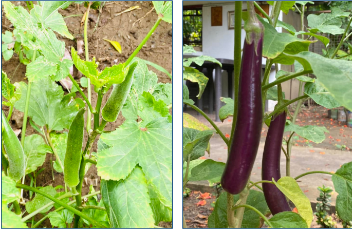
At St. Camillus Mission Station, the vegetables are now bearing fruit.

We need a major plan to build resilient communities, able to withstand adversity and use it as an opportunity to grow and be successful!